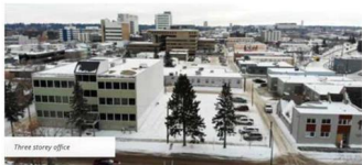
Three story office