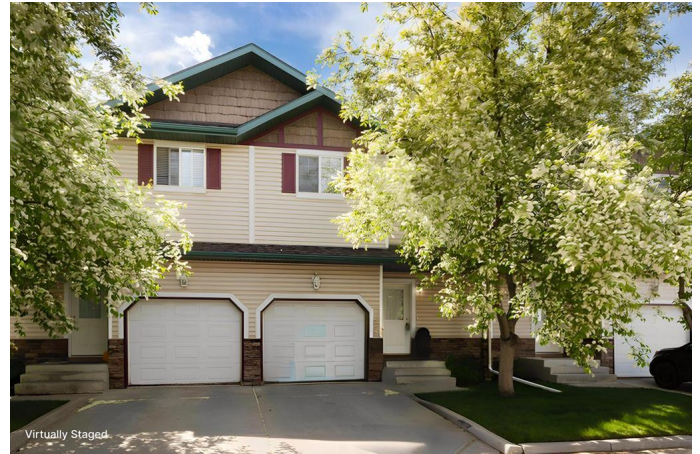
103-88 Westbury Pl SW, Calgary, AB

~Stunning Renovated Townhouse in Coveted West Springs~ Welcome to this beautifully updated 3-bedroom, 3.5-bathroom townhouse, ideally located in the heart of Calgary's prestigious West Springs community. Renovated over the past 6 years, this immaculate home blends modern elegance with everyday comfort, perfect for families, professionals, or anyone seeking a refined urban lifestyle with a natural touch. Step inside to a bright and inviting open-concept living space featuring stylish finishes, a cozy gas fireplace, and an abundance of natural light. The custom kitchen is a chef's dream with sleek cabinetry, quartz countertops, stainless steel appliances, and ample space for cooking and entertaining. Upstairs, you'll find three generously sized bedrooms, including a serene primary suite complete with a spacious walk-in closet and a private ensuite. With 3.5 bathrooms and a convenient upper-floor laundry room, this home is designed for functionality and ease. Enjoy the convenience of a single attached garage and the beauty of nearby parks, walking and biking paths, and scenic green spaces. You're also just minutes from top-rated schools, boutique shopping, trendy restaurants, and cozy coffee spots. Whether you're commuting downtown in just 10 minutes or heading west to the mountains for a weekend escape, this unbeatable location offers the best of both worlds.